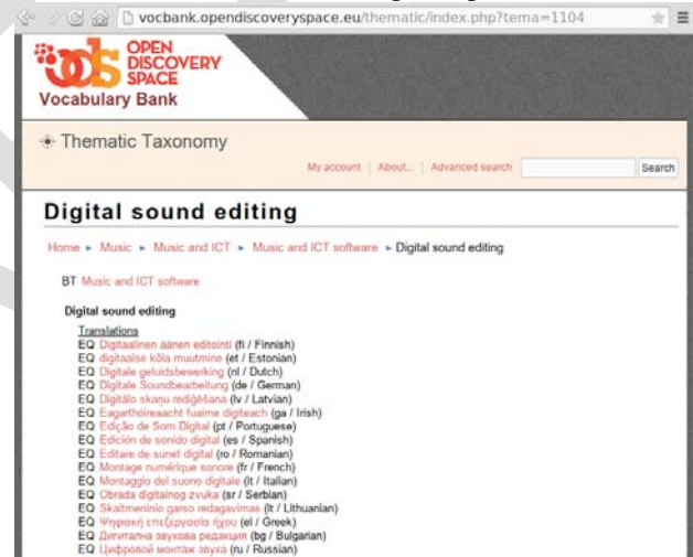
Fig. 2. The page of the term "Digital sound editing"

ODS infrastructure. Meeting the requirements set in section 3, it facilitates authorized users for editing and organizing the terms, their descriptions, translations and relations. Additionally, it assists in linking terms between associated vocabularies and supports Semantic Web technologies for exporting the ODS terms in Linked Data formats. Through the ODS Vocabulary Bank, all terms of relevant vocabularies are publicly available to every interested party, readily accessible with any modern web browser, as well as via well-documented web services. Furthermore, the ODS Vocabulary Bank enables a complete export of the vocabularies and taxonomies using well-established specifications and file formats (SKOS-Core, Zthes, TopicMaps, Dublin Core, etc.).